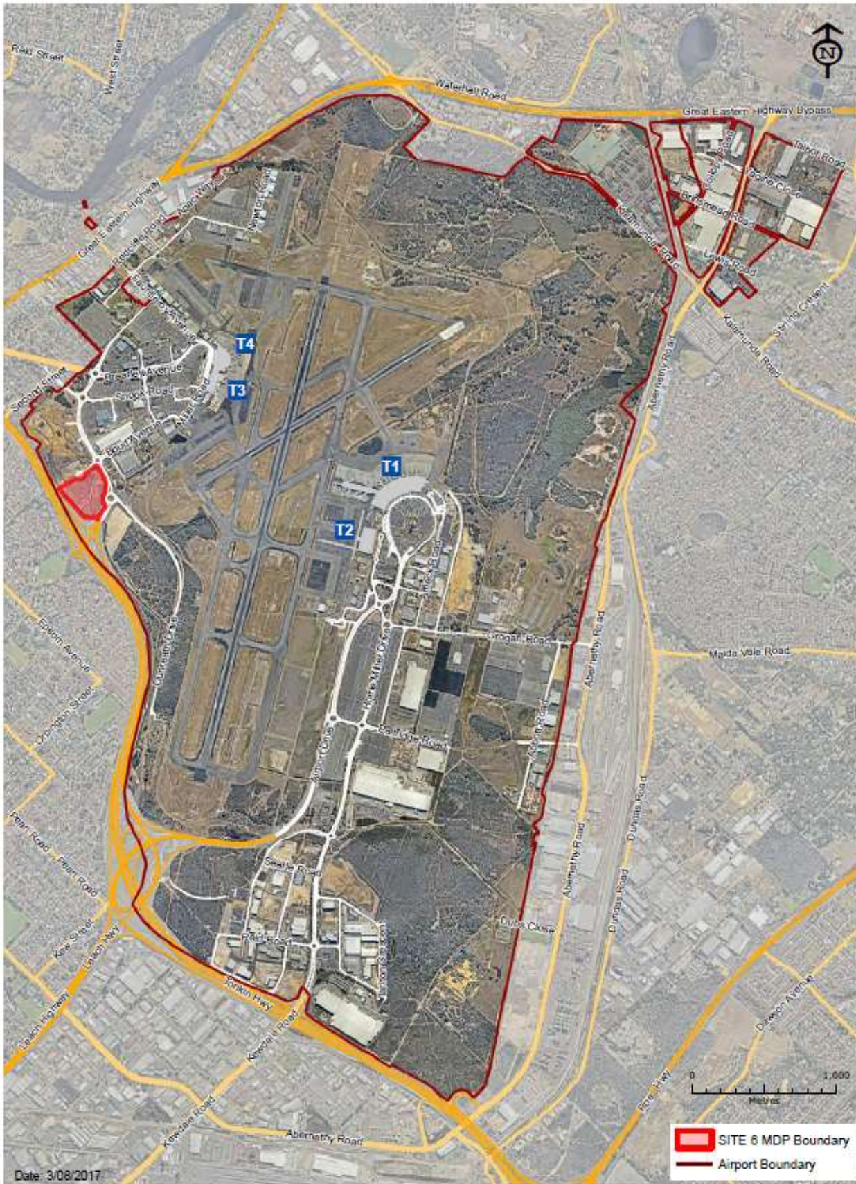
Figure 1: Activity Location