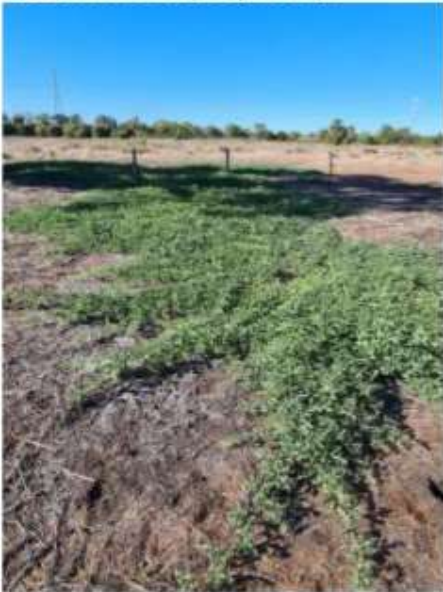
Photo 5. Melon on the inside of the boundary

On 26 th March a patch of melon was identified on the northern boundary of the site (see photo 5) and was removed (see photo 6).