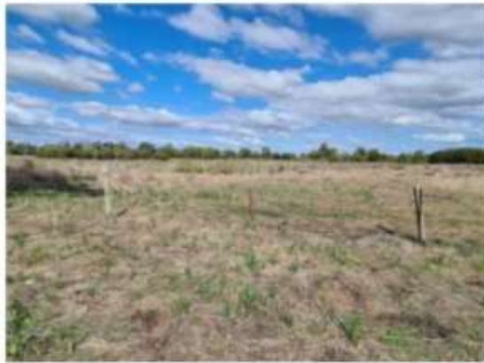
Photo 6. All melon removed